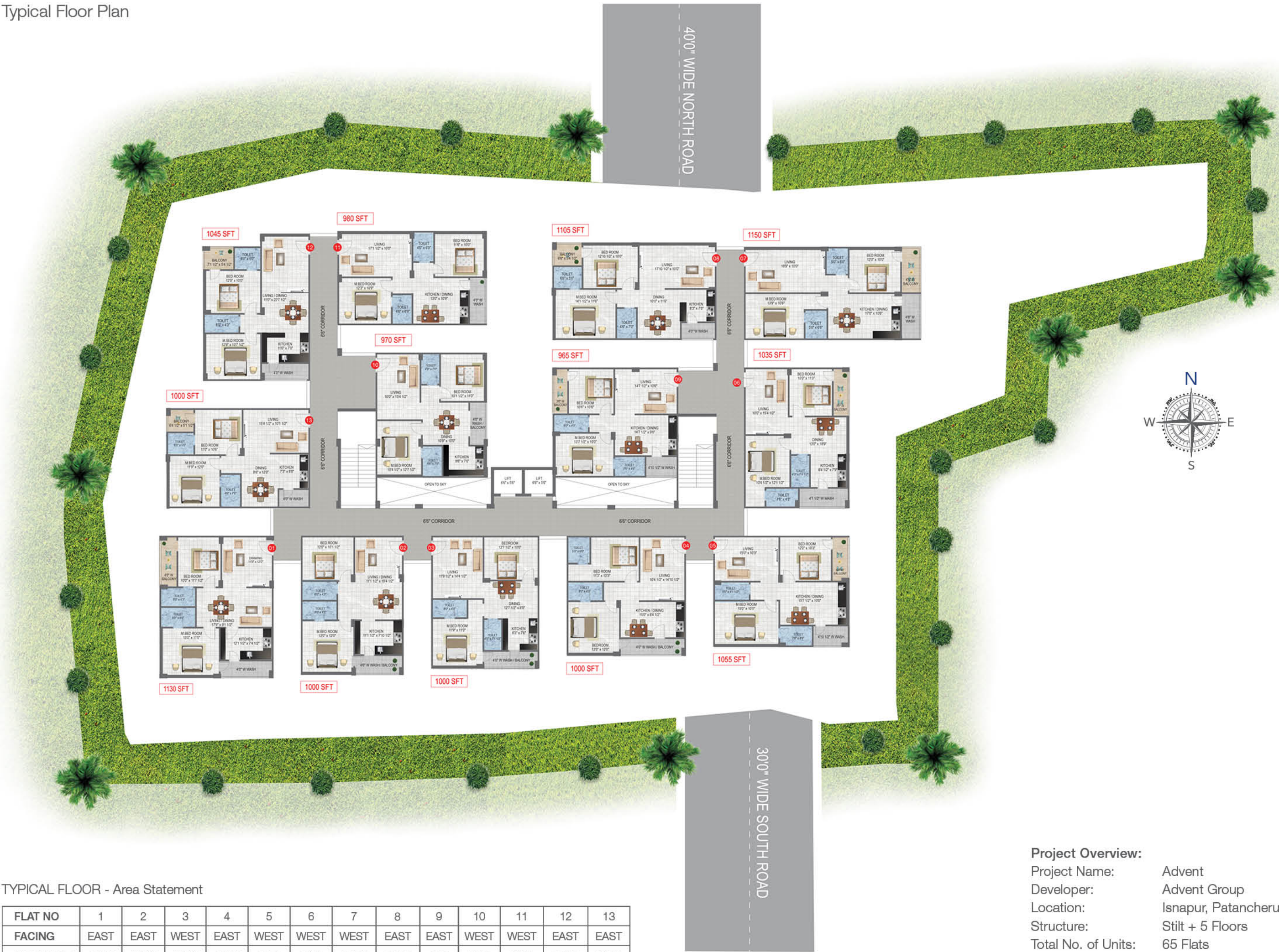
TYPICAL FLOOR - Area Statement